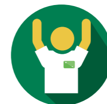
Fan badges (packs of 25)