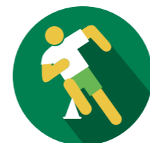
Player t-shirts (for warm-ups)

Level Playing Field offers a range of branded matchday items to help your club raise awareness for the Unite For Access campaign.