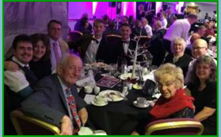
“Question of Sport”

The DSA had 2 tables at the club’s “Question of Sport” event at the Liberty Stadium on 05 December. One of our DSA sponsors, Dawsons, came along and joined in the fun. Everyone had a great time.