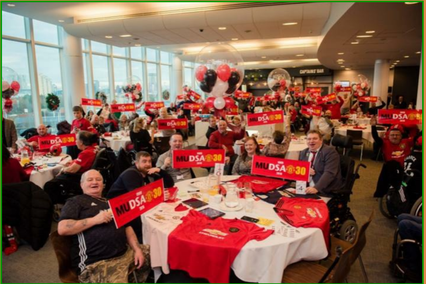
MUDSA Christmas Party held on December 17 2019