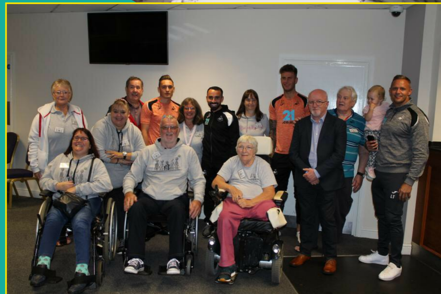
Swansea DSA Event held on 13 September with members and players

Editor's Note: - Connor Roberts spent the 2015-2016 season on loan at Yeovil where he made 45 appearances for the club. We have monitored his progress to Swansea first team and now to Welsh full international.