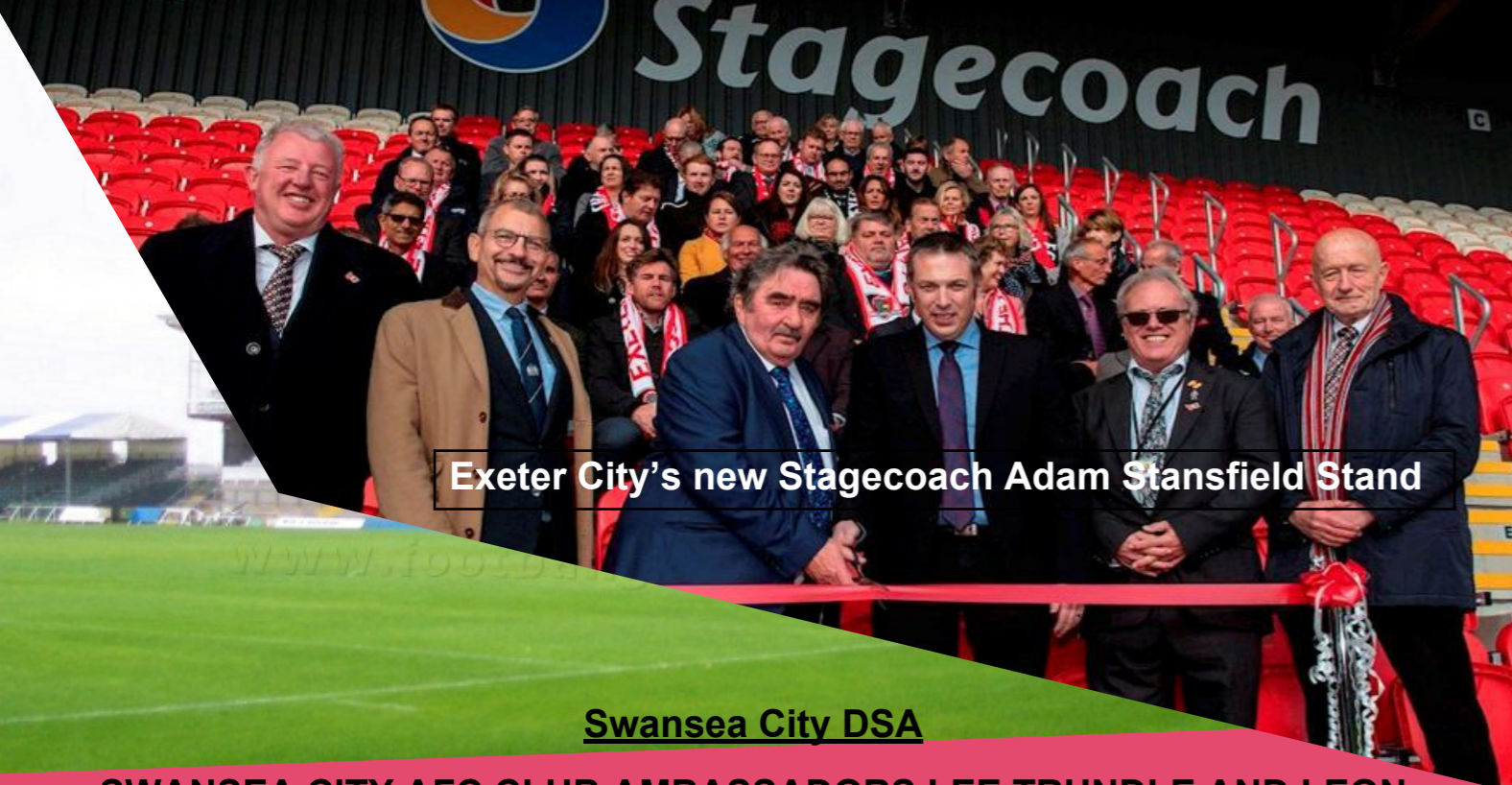
Exeter City's new Stagecoach Adam Stansfield Stand