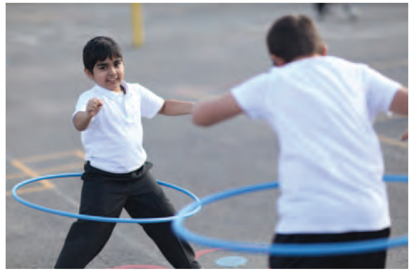
Healthy Schools London, Mayor of London programme