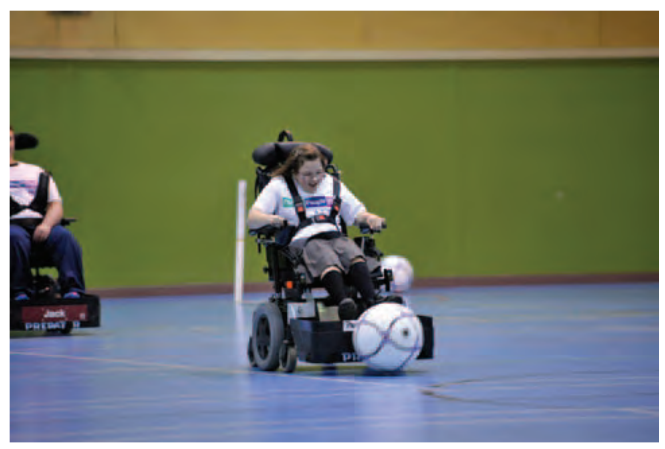
A Sport England Inclusive Sport project