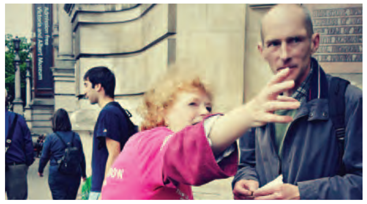
Team London Ambassadors at the V&A